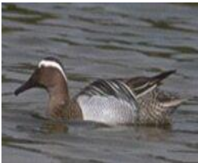
A055 - /ANAS QUERQUEDULA/