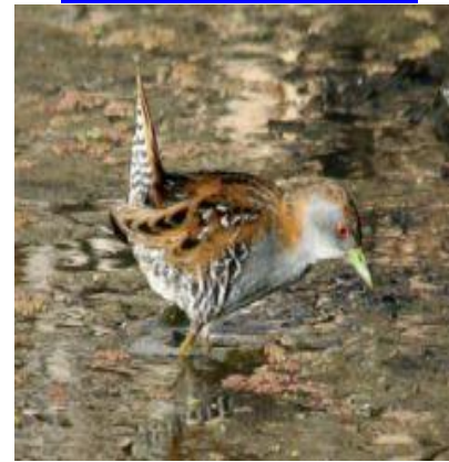
A121 - /PORZANA PUSILLA/