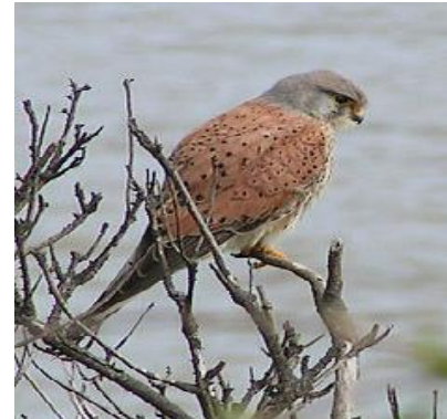
A096 - /FALCO TINNUNCULUS/