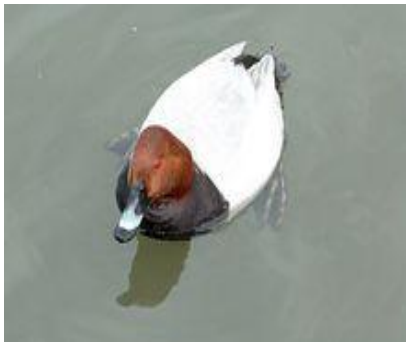
A059 - /AYTHYA FERINA/