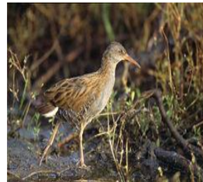
A118 - /RALLUS AQUATICUS/