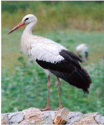
A031 - /CICONIA CICONIA/