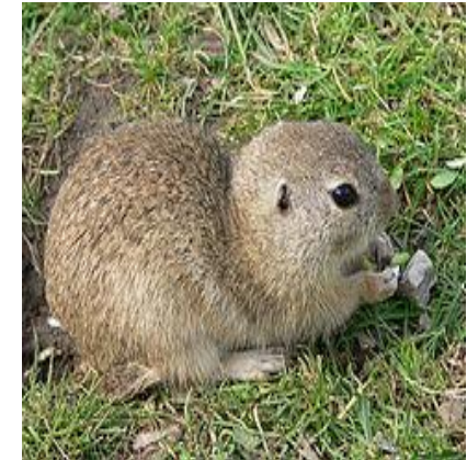
1335 - /SPERMOPHILUS CITELLUS/