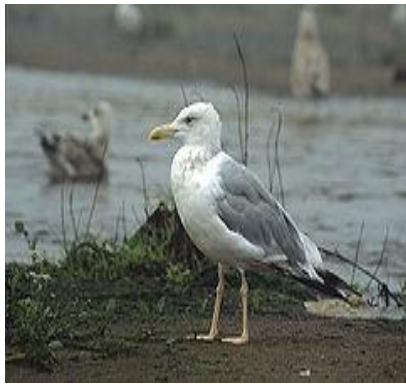
A459 - /LARUS CACHINNANS/