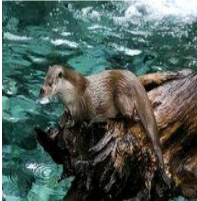
1355 - /LUTRA LUTRA/

1355 - /LUTRA LUTRA/ 2609 - ( ) /MESOCRICETUS NEWTONI/ 1352 - /CANIS LUPUS/ 1335 - /SPERMOPHILUS CITELLUS/ 2635 - /VORMELA PEREGUSNA/