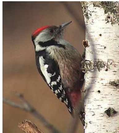
A238 - /DENDROCOPOS MEDIUS/