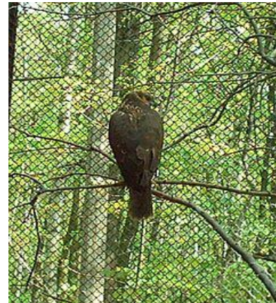
A081 - /CIRCUS AERUGINOSUS/