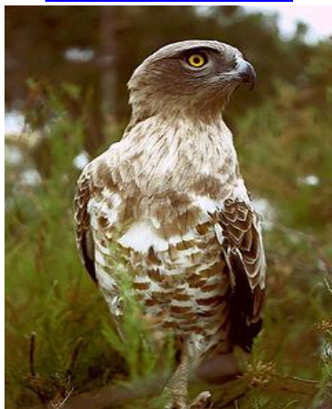
A080 - /FALCO TINNUNCULUS/