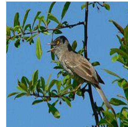
A307 - /SYLVIA NISORIA/