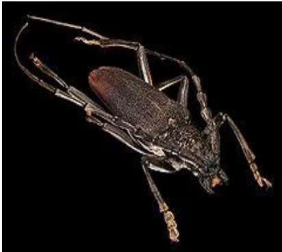
1088 - /CERAMBYX CERDO/