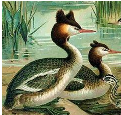
A005 - /PODICEPS CRISTATUS/