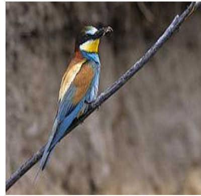
A230 - /MEROPS APIASTER/