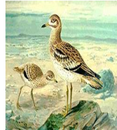
A133 - /BURHINUS OEDICNEMUS/