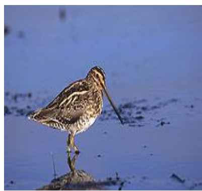
A153 - /GALLINAGO GALLINAGO/