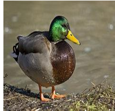
A053 - /ANAS PLATYRHYNCHOS/