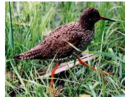
A162 - /TRINGA TOTANUS/