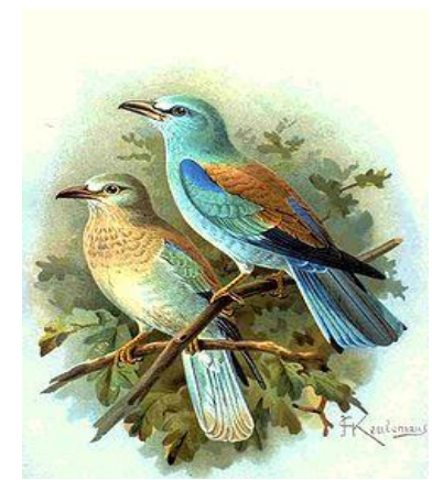
A231 - /CORACIAS GARRULUS/