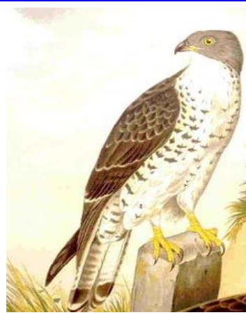
A072 - /FALCO TINNUNCULUS/