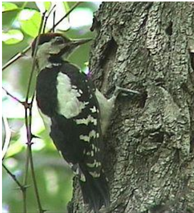
A429 - /DENDROCOPOS SYRIACUS/