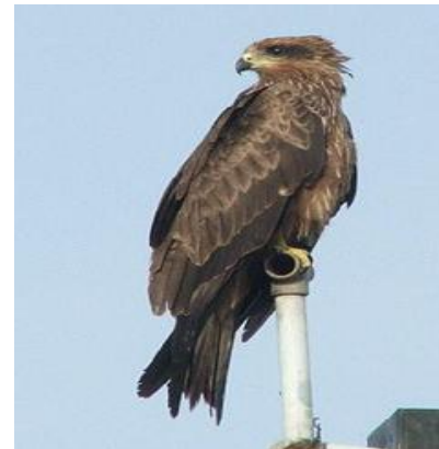
A073 - /MILVUS MIGRANS/