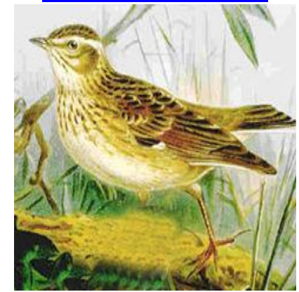
A246 - /LULLULA ARBOREA