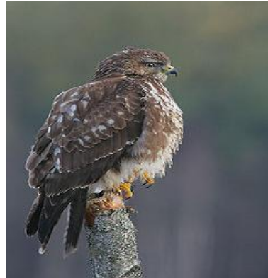
A087 - /BUTEO BUTEO/