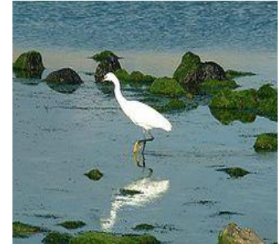
A026 - /EGRETTA GARZETTA/