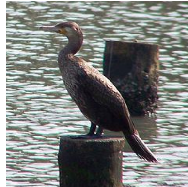
A017 - /PHALACROCORAX CARBO/