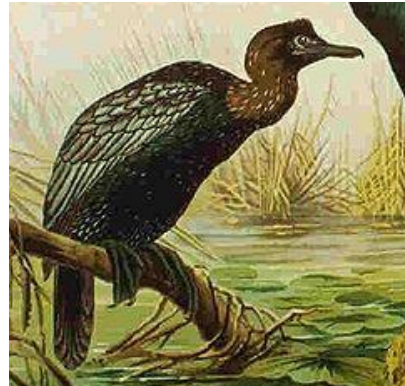
A393 - /PHALACROCORAX PYGMAEUS/