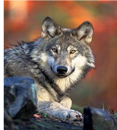
1352 - /CANIS LUPUS/