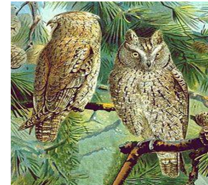
A214 - /OTUS SCOPS/