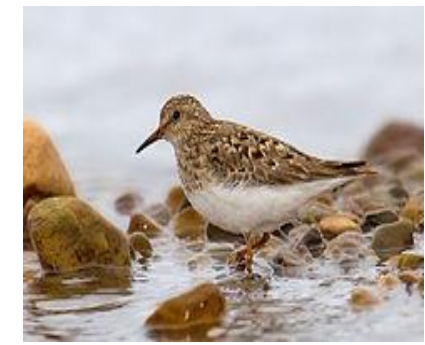
A146 - /CALIDRIS TEMMINCKII/