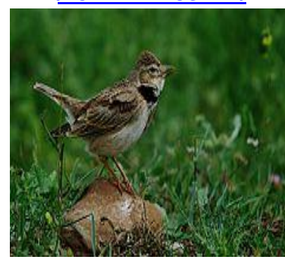
A242 - /MELANOCORYPHA CALANDRA/