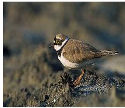
A136 - /CHARADRIUS DUBIUS/