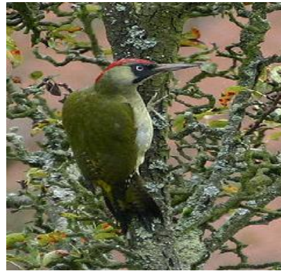
A235 - /PICUS VIRIDIS/