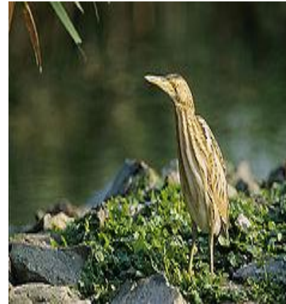
A022 - /IXOBRYCHUS MINUTUS/