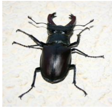
1083 - /LUCANUS CERVUS/