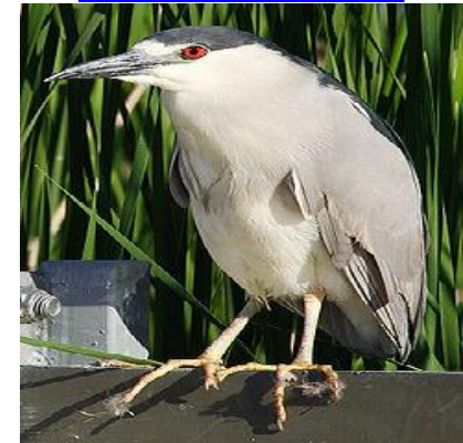
A023 - /NYCTICORAX NYCTICORAX/