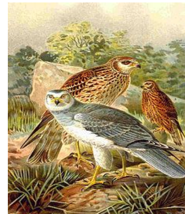
A082 - /CIRCUS CYANEUS/