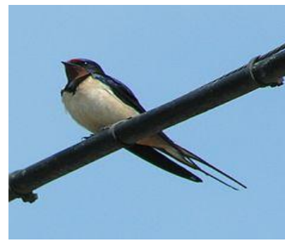
A251 - /HIRUNDO RUSTICA/