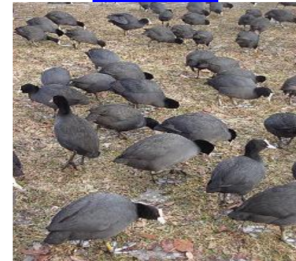
A125 - /FULICA ATRA/