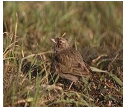
A244 - /GALERIDA CRISTATA/