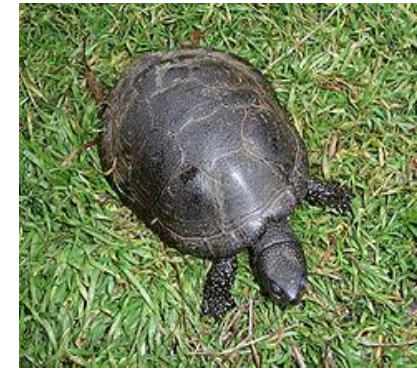
1220 - /EMYS ORBICULARIS/