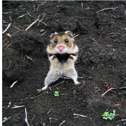
2609 - ( ) /MESOCRICETUS NEWTONI/