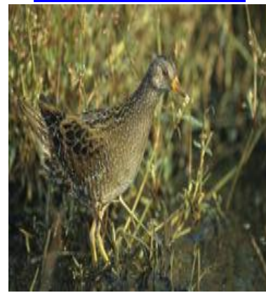
A119 - /PORZANA PORZANA/