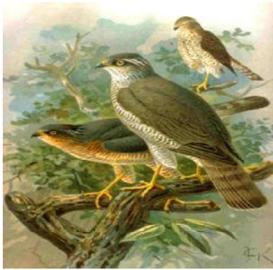
A086 - /ACCIPITER /NISUS/