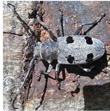
1089 - /MORIMUS FUNEREUS/