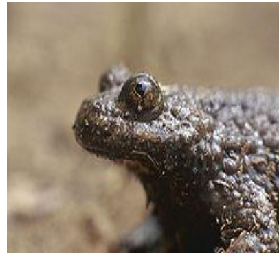
1193 - /BOMBINA VARIEGATA/