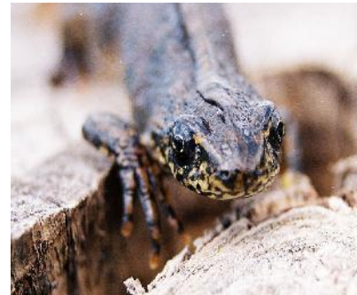
1171 - /TRITURUS KARELINII/