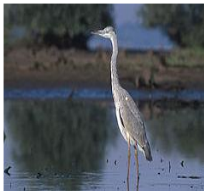
A028 - /ARDEA CINEREA/