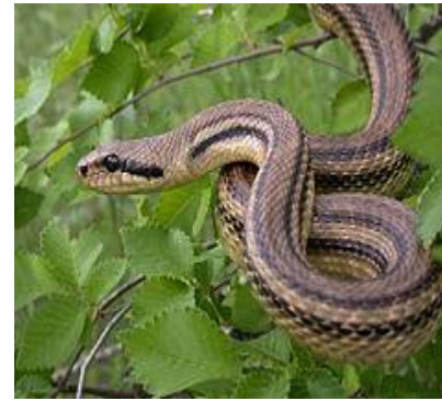
1279 - /ELAPHE QUATUORLINEATA/