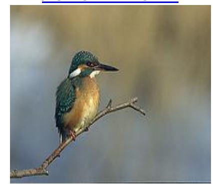
A229 - /ALCEDO ATTHIS/