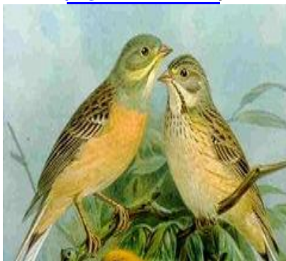
A379 - EMBERIZA HORTULANA/