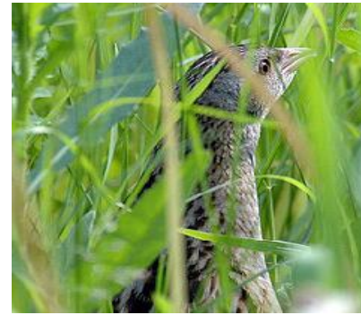
A122 - /CIRCUS CREX/