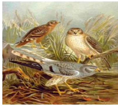
A084 - /CIRCUS PYGARGUS/