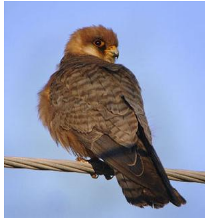
A094 - /FALCO VESPERTINUS/