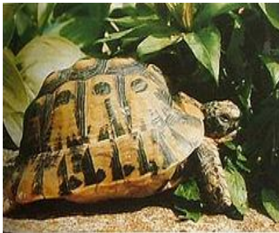
1219 - /TESTUDO GRAECA/