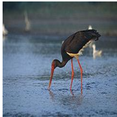
A030 - /CICONIA NIGRA/