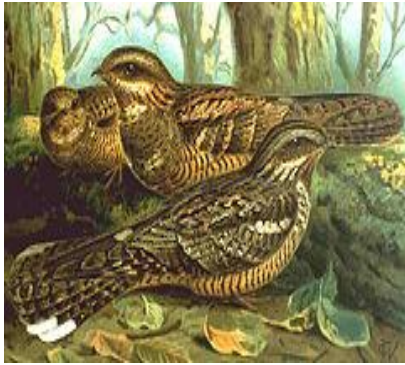
A224 - /CAPRIMULGUS EUROPAEUS/