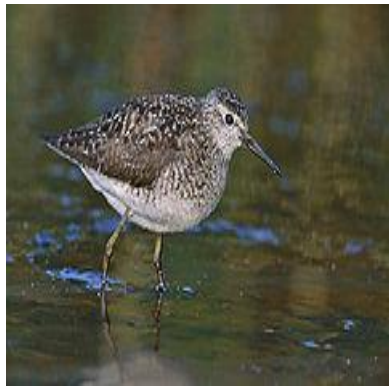
A166 - /TRINGA GLAREOLA/