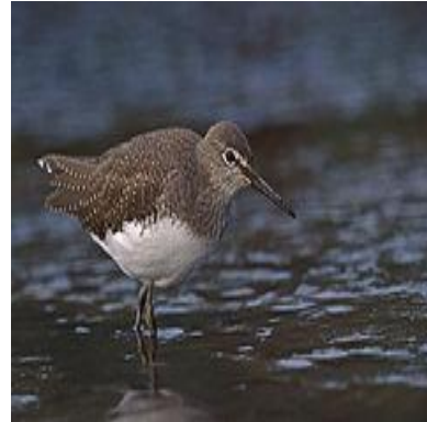
A165 - /TRINGA OCHROPUS/