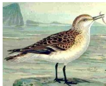
A145 - /CALIDRIS MINUTA/