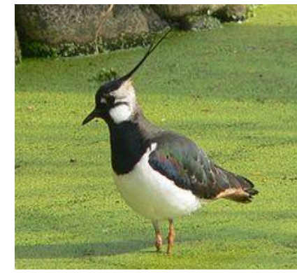
A142 - /VANELLUS VANELLUS/