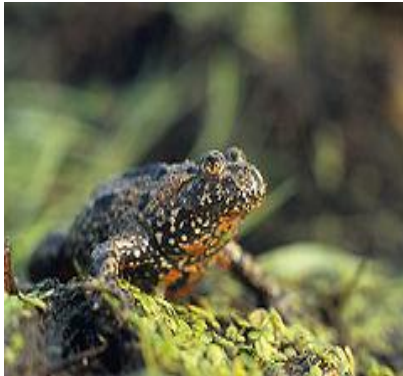
1188 - /BOMBINA BOMBINA/