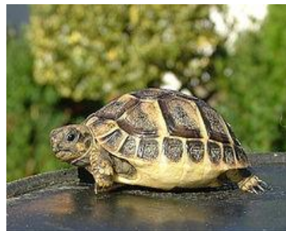
1217 - /TESTUDO HERMANNI/