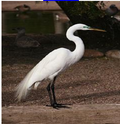
A027 - /EGRETTA ALBA/