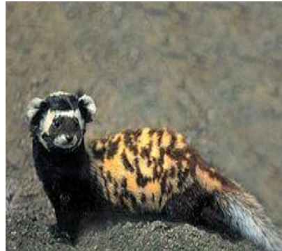
2635 - /VORMELA PEREGUSNA/