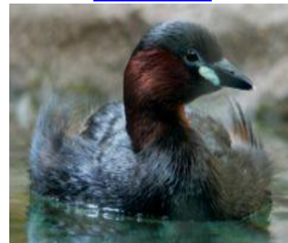
A004 - /TACHYBAPTUS RUFICOLLIS/