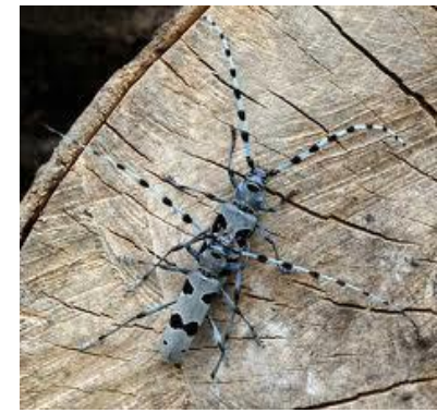
1087 - /ROSALIA ALPINA/