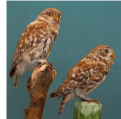
A218 - /ATHENE NOCTUA/