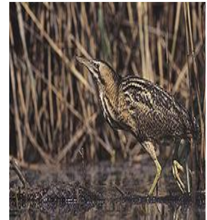
A021 - /BOTAURUS STELLARIS/