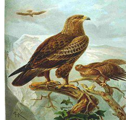
A089 - /ACCIPITER POMARINA/