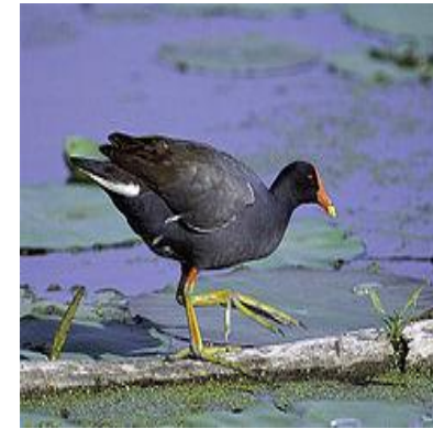
A123 - /GALLINULA CHLOROPUS/