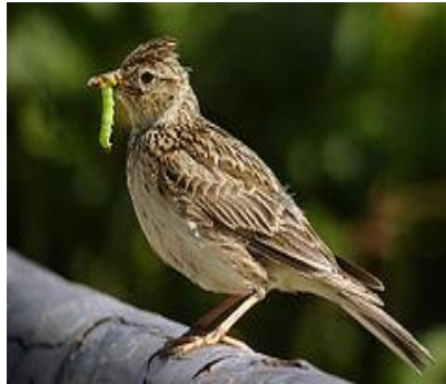
A247 - /ALAUDA ARVENSIS/