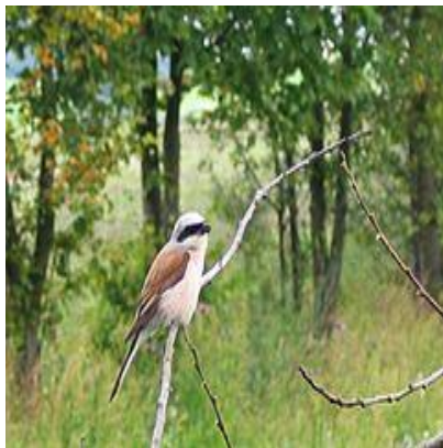
A338 - /LANIUS COLLURIO/