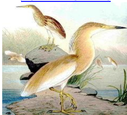
A024 - /ARDEOLA RALLOIDES/